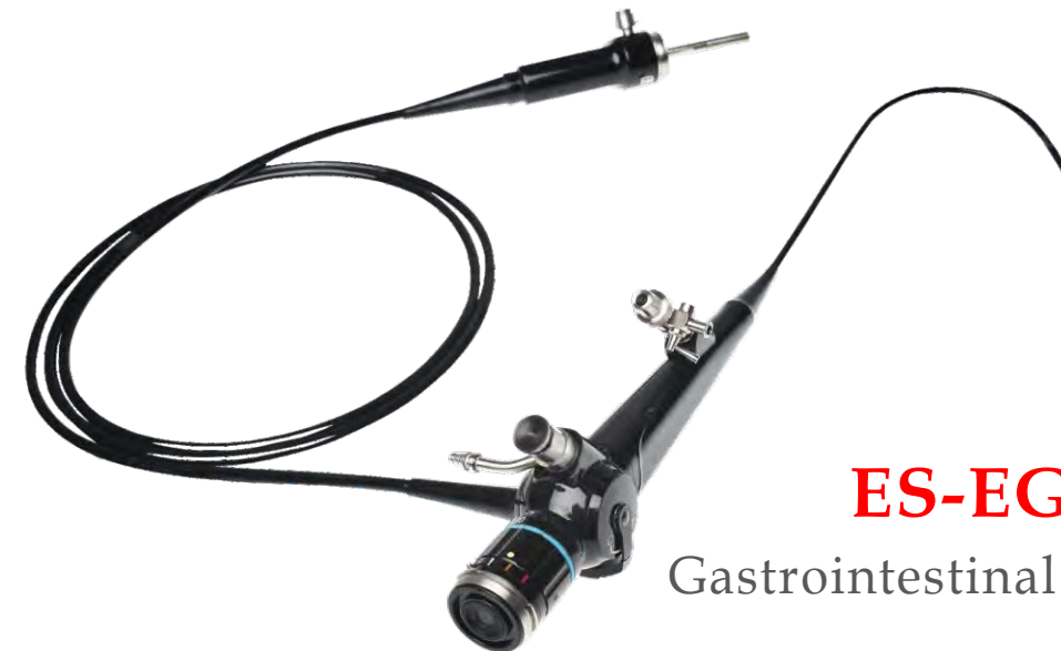
ES-EGS69 / ES-EGS70 Gastrointestinal & Colono VideoScope